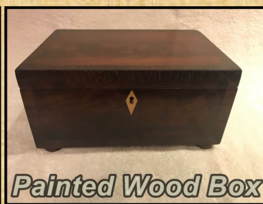
Painted Wood Box

If you are donating a Silent Auction item, email me a picture and description prior to December 11th: estesf@troycable.net