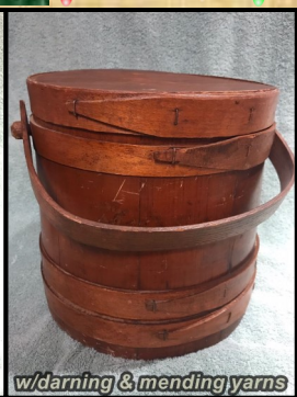
w/darning & mending yarns