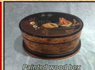
Painted wood box

All Silent Auction items were donated by our MOAA Chapter officers & directors, and by local businesses. All proceeds go to our MOAA Fort Rucker Chapter's Scholarship Fund. BID GENEROUSLY!