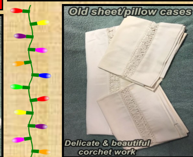
Old sheet/pillow cases