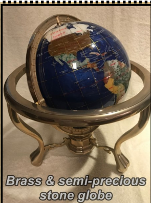
Brass & semi-precious stone globe