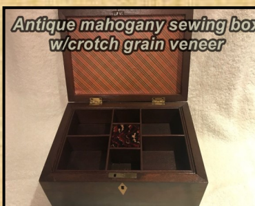
Antique mahogany sewing box w/crotch grain veneer