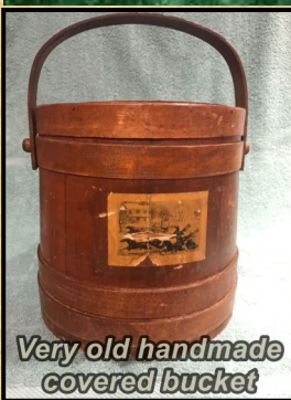
Very old handmade covered bucket