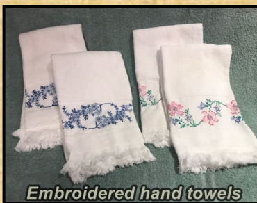
Embroidered hand towels