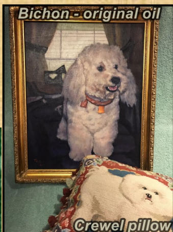
Bichon - original oil